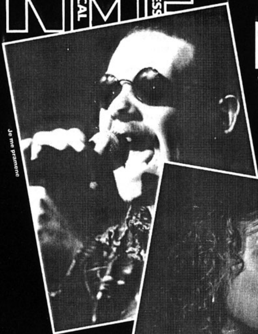
Je me pramene